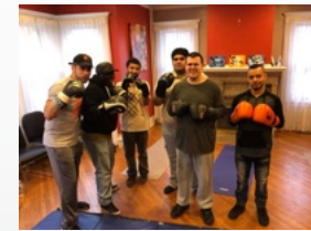
Body T-Fit Boxing (Used as an outlet)