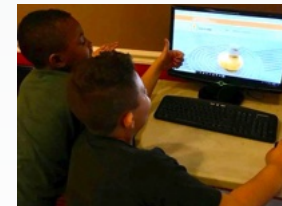
Principle of the Day