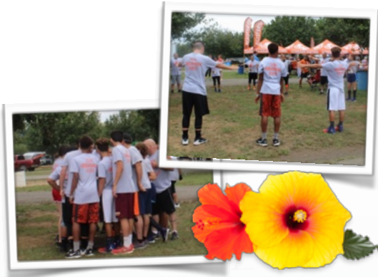
Character development through physical fitness

Through physical activities, team work and fun the youth will activate their inner strength to be the best “me” they can be. In doing so they will also learn the importance of helping others, build their confidence, boost their self-esteem and more. Developing these characteristics will influence them throughout their lives.