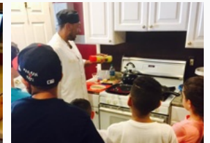
Intro to Nutrition (Intro to Healthy Eating)