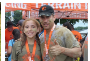
Obstacle Races (Certificate of Completion)